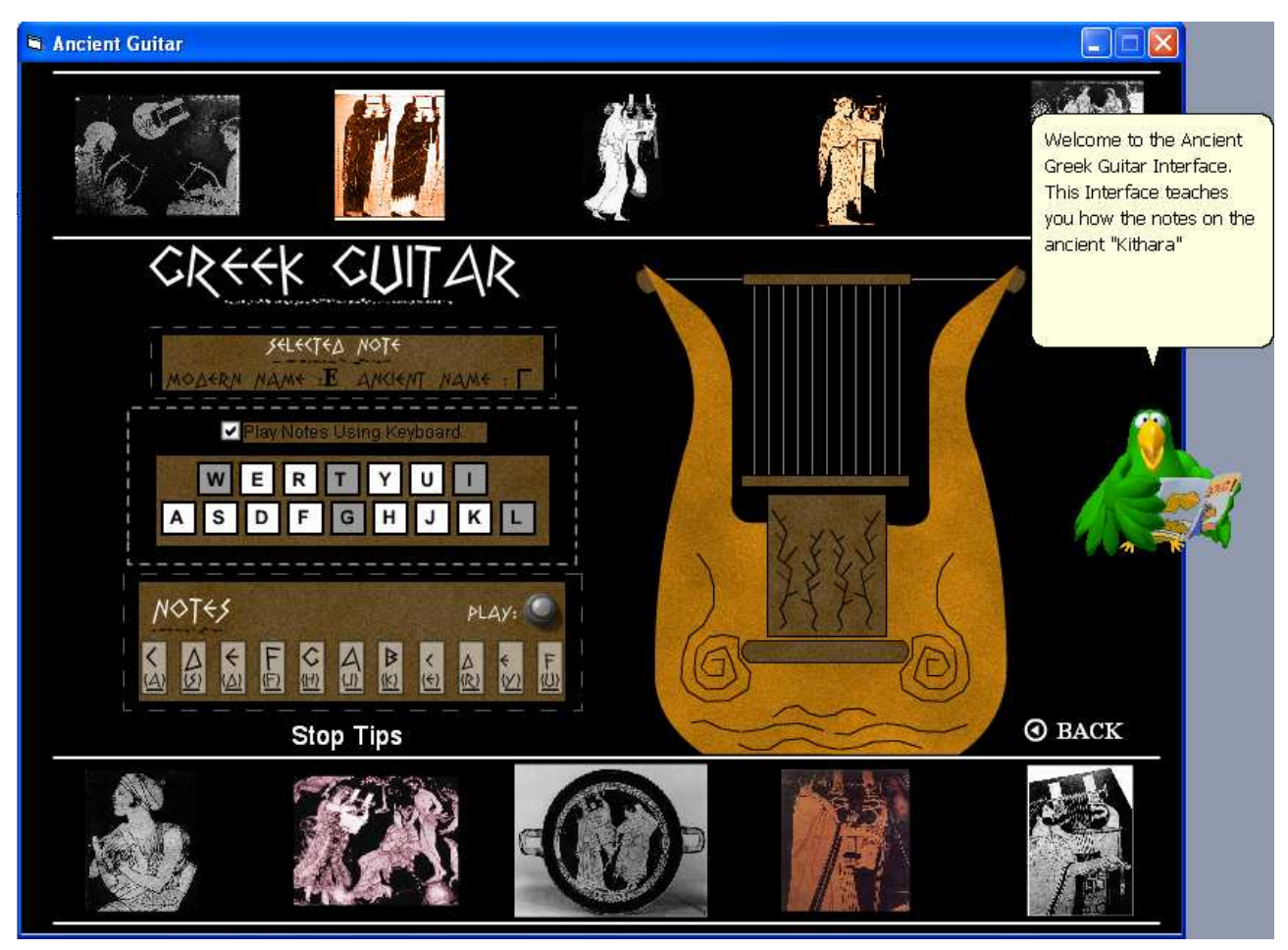
Fig 3. The Ancient Greek Guitar ("Kithara"). On the right is visible the "talking parrot", a Microsoft text-to-speech agent that orally instructs on the use of the "kithara." The Graphical User Interface of ARION.

musicians, through snapshots from angiographies and wall paintings. The photographic material comes from real archeological treasures of Ancient Greece. Information about the AGM instruments can be found in the second circle.