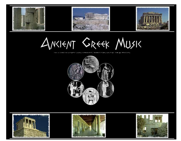
Fig. 2. The graphical User Interface of ORPHEUS.

The central user interface of ORPHEUS is presented in Fig. 2. The music track that can be listened to during the introduction of the presentation has been exclusively written for the application and is about a musical composition with contemporary hearings, which is influenced from AGM in many ways (melody, instruments, modes, rhythm.)